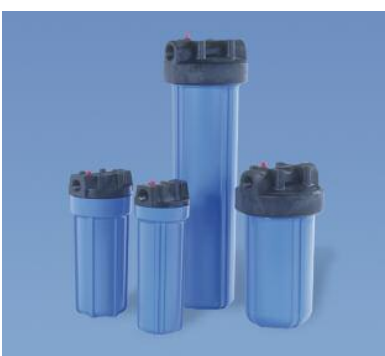
Blue / Black