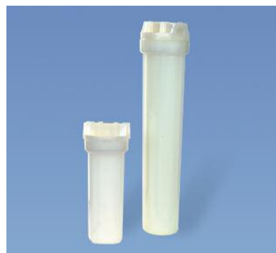
Virgin Polypro DOE & "222"