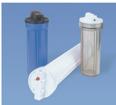
Residential Series 4200 (10") & 7000 (20")