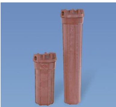
High Temp 4500HT (10") & 8000HT (20")