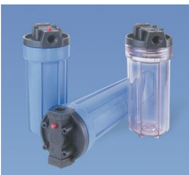
Commercial Series 4500 (10") & 8000 (20")