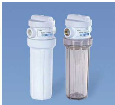
Valve-In-Head Opaque & Clear