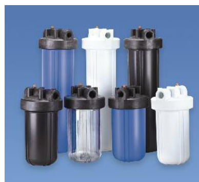
Full-Filt (B-B) Series 5000 (10") & 10000 (20")